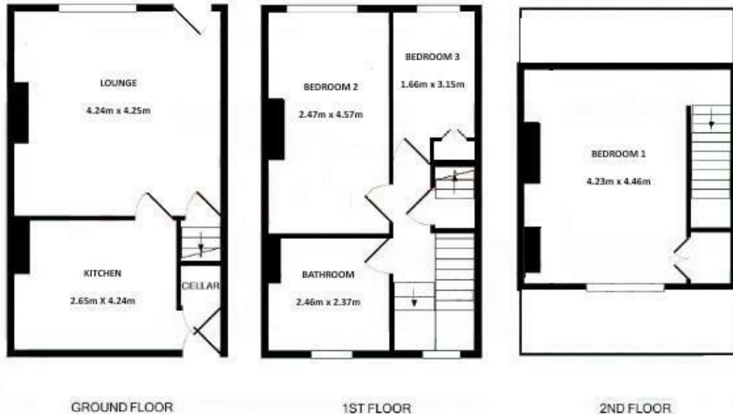
PARK ROAD WEST Measurements are approximate. Not to scale. Illustrative purposes only Made with Metropix ©2020